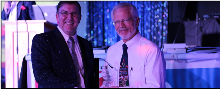
Stephen Claxton Cone Head Award