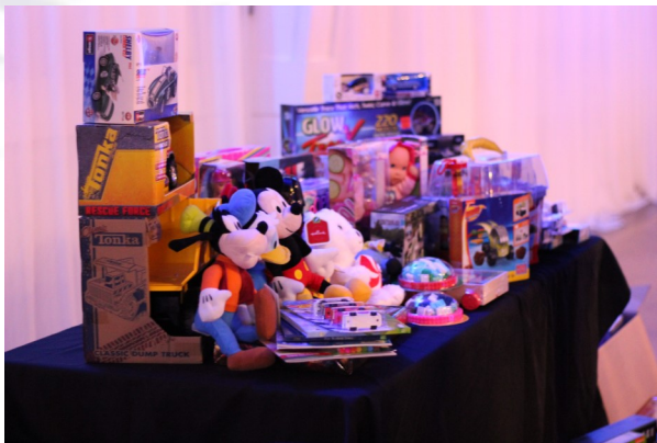
Collections from the MSCC annual toy drive for the Lake County Sherriff's Office