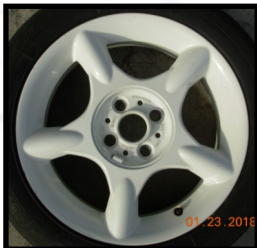
16x6.5 4x100 +48 Mini Style 83 Original $200 (bcturn@gmail.com)