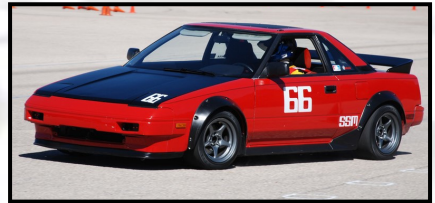
1985 Toyota MR2 ~ $5500 Including parts car. (rootes66@earthlink.net)