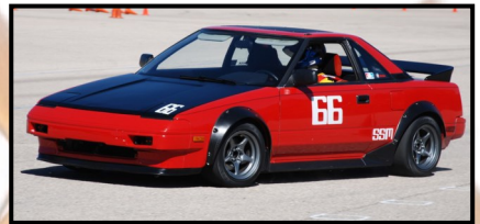
1985 Toyota MR2 ~ $5500 Including parts car. (rootes66@earthlink.net)