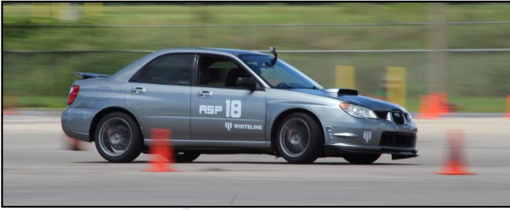
Zsa Zsa Blyden