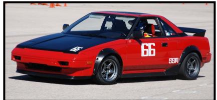
1985 Toyota MR2 ~ $5500 Including parts car. (rootes66@earthlink.net)