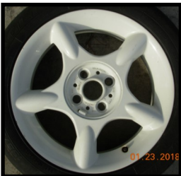
16x6.5 4x100 +48 Mini Style 83 Original $200 (bcturn@gmail.com)