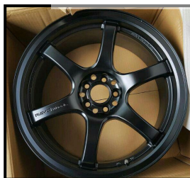
18x8.5 5x100 +38 Volks Gram Lights $1400 OBO. (zaneplumley@earthlink.net)