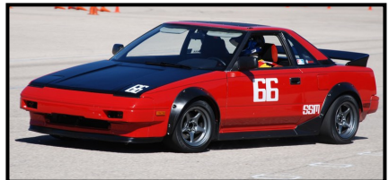
1985 Toyota MR2 ~ $5500 Including parts car. (rootes66@earthlink.net)