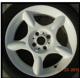
16x6.5 4x100 +48 Mini Style 83 Original $200 (bcturn@gmail.com)