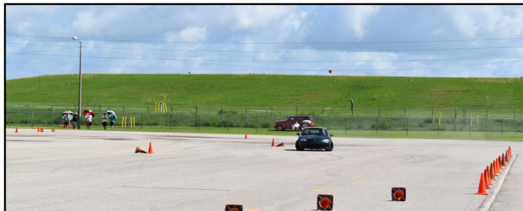
Roy "Oops wrong way" Watters