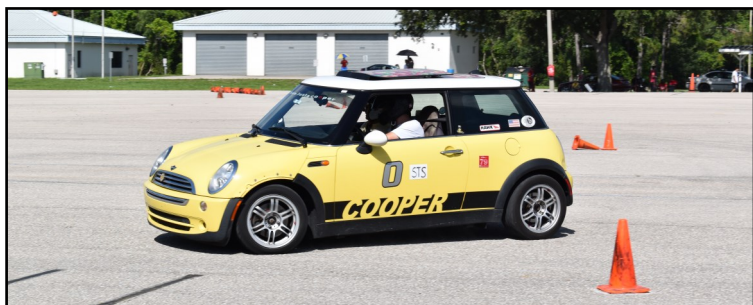
Travis "Co-drive & beat every car owner" Turner