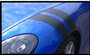
Grand Sport fender strips ~ $20 (wokeefe2000@yahoo.com)

If you would like to submit a classified ad, simply send an e-mail to nanuka627@yahoo.com titled "SWAP TIME" for publication. Classifieds are provided here as a free service to the members of MSCC.