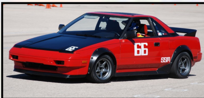
1985 Toyota MR2 ~ $5500 Including parts car. (rootes66@earthlink.net)