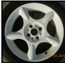
16x6.5 4x100 +48 Mini Style 83 Original $200 (bcturn@gmail.com)