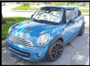
'13 Mini Cooper $11,250 (bobblucher@gmail.com)

If you would like to submit a classified ad, simply send an e-mail to nanuka627@yahoo.com for publication. Classifieds are provided here as a free service to the members of the Martin Sports Car Club .