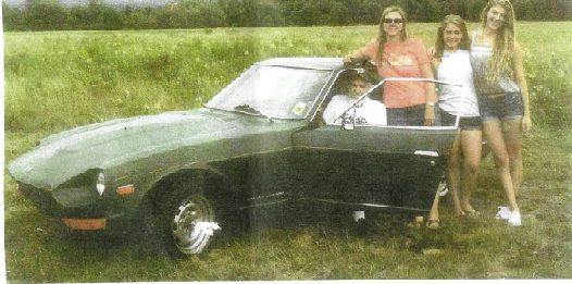
"Grumpy Old Folks" N.Y. Pit Crew - 2014

But will I be contented To just stand and man a corner Or will I climb back in again, And perhaps become a winner. To watch them run, to one like me, Can never be the same - So I'll go on - the oldest Active driver in the game!