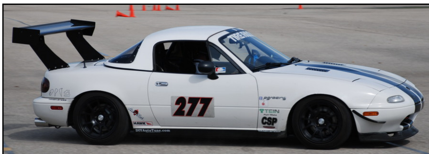
Leland Giddens, with optional picnic table/spoiler.