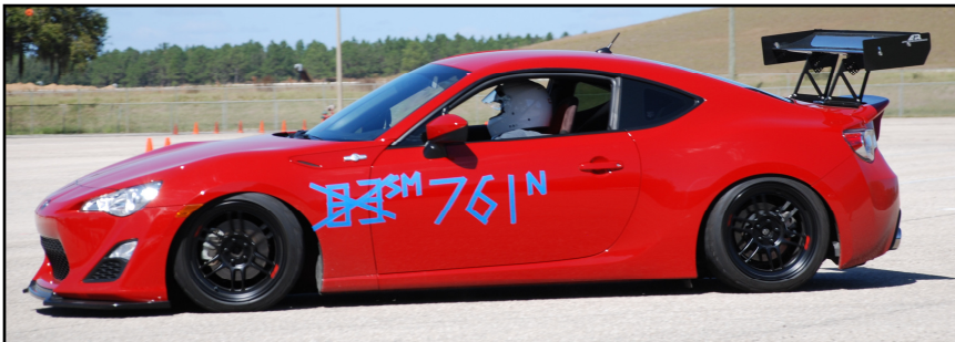
Gregg Omine, Scion FRS