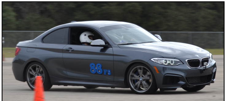
Right: Zame Plumley BMW M235i