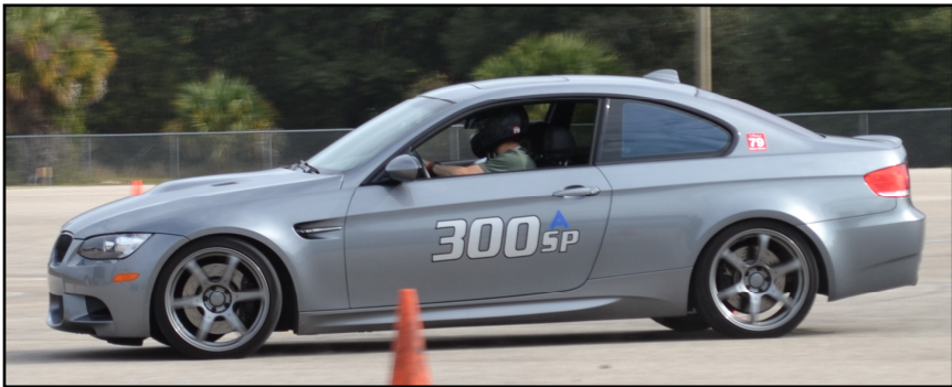
Above: Travis Turner BMW M3