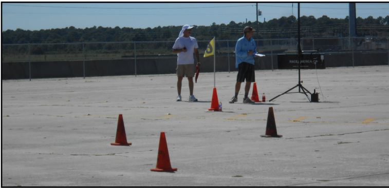
Fearless course workers