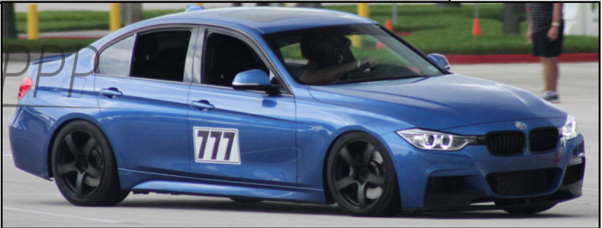
Bill Cassidy, BMW 335