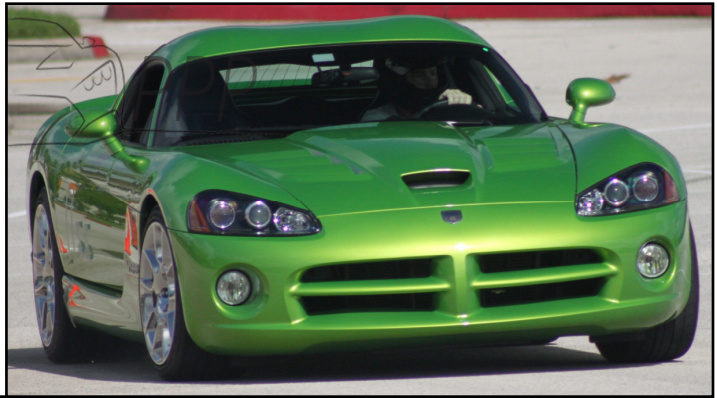
Cliff Bordwell Dodge Viper