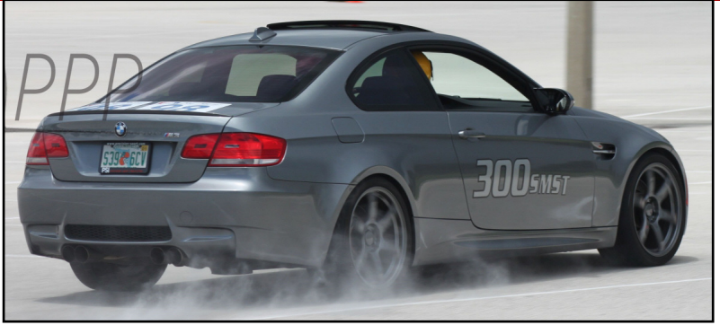
Travis Turner BMW M3