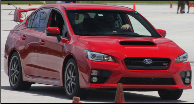
Matt Neves, Subaru STI