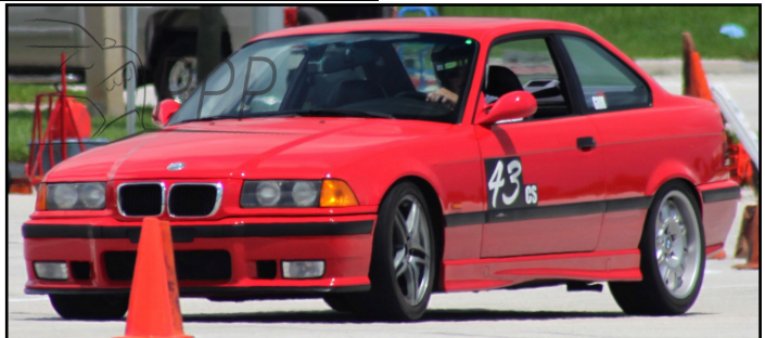
Dave Erecitano BMW M3