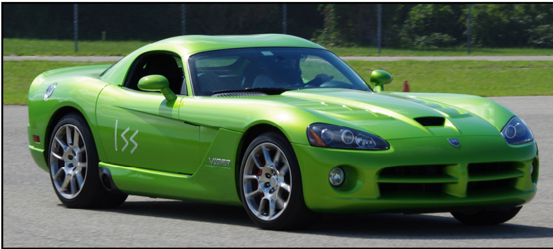
Above: Cliff Bordwell Dodge Viper