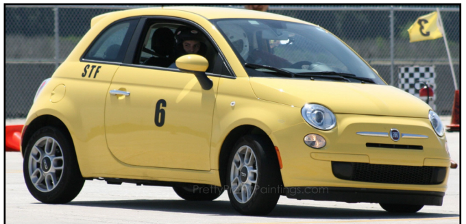
Mikael Edstrom, Fiat 500