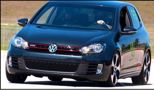
Matt Neves VW GTI