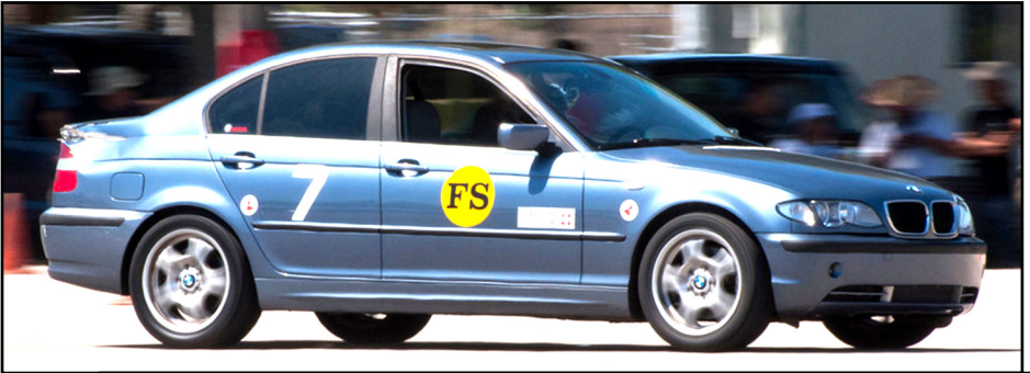
Below: Satya Menon BMW 330i