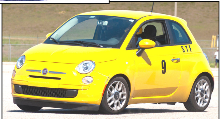
Victoria Edstrom Fiat 500