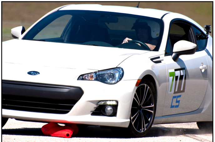
Right: Jake Engstrom Subaru BRZ with optional cone catcher