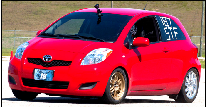
Buzz Thompson Fiat 500