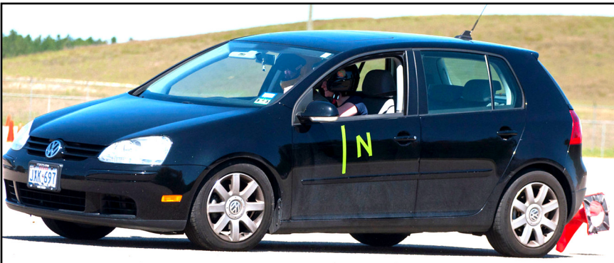
Raven Sanders, VW Rabbit