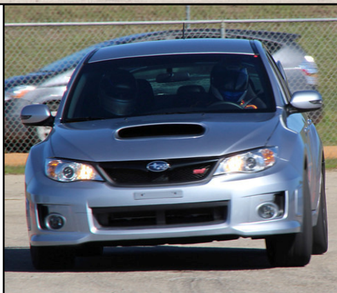
Left: Salim Ghorayeb Subaru WRX STi