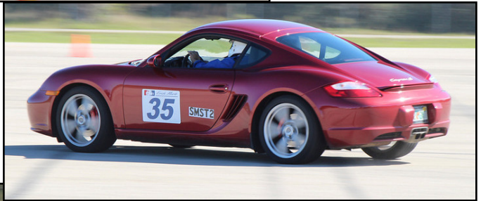
Below: Erich Mertz Porsche Cayman S