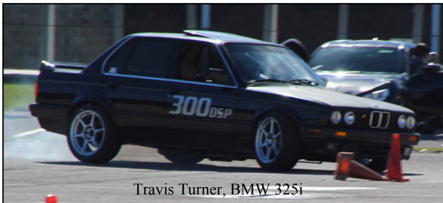
Travis Turner, BMW 325i