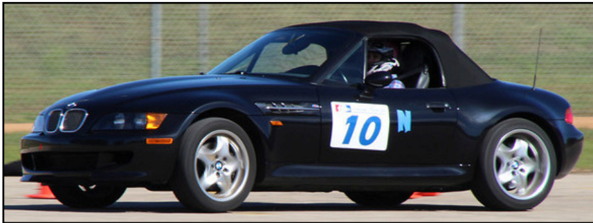
Above: Ludwig Bavetta BMW Z3M