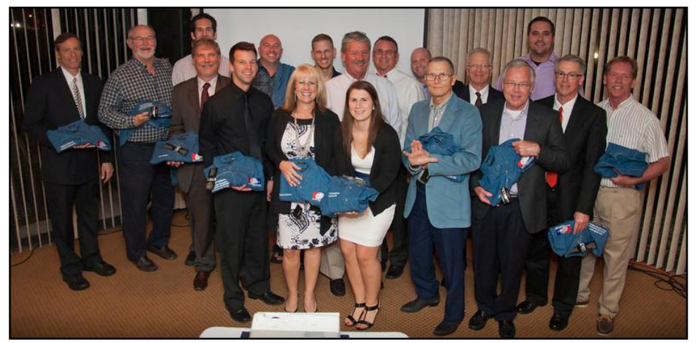
Your 2013 Active Members

(well, those who attended the Awards Banquet)