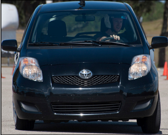
Left: Enoch Dinslery, Smile-inducing Toyota Yaris