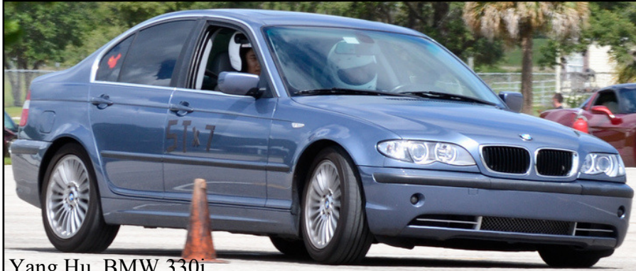
Yang Hu, BMW 330i