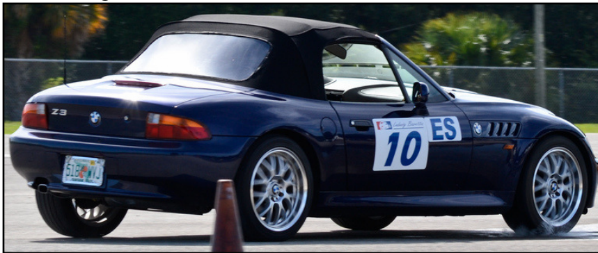
Ludwig Bavetta, BMW Z3