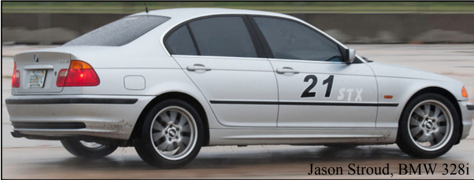
Jason Stroud, BMW 328i