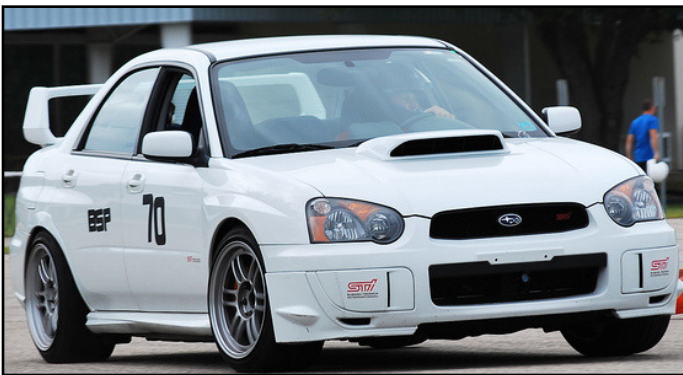
Drew Hackett, Subaru WRX STi