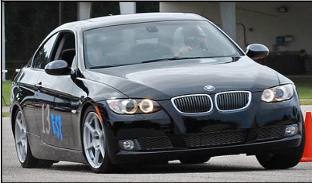
Left: Bert Foschini, BMW 335i