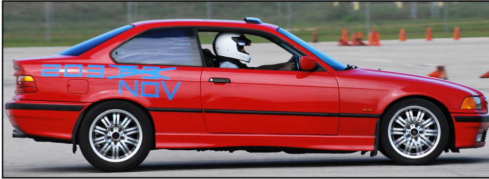
Ross Hristov, BMW 323is