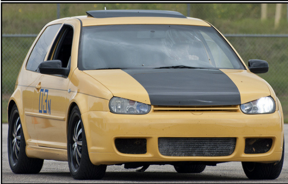
Paul Stransky, Angry looking VW Golf