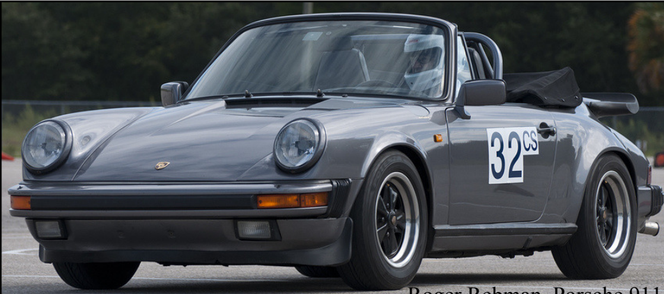
Roger Rebman, Porsche 911