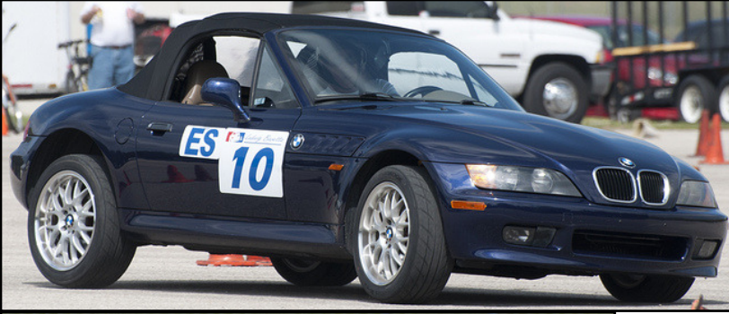
Ludwig Bavetta, BMW Z3