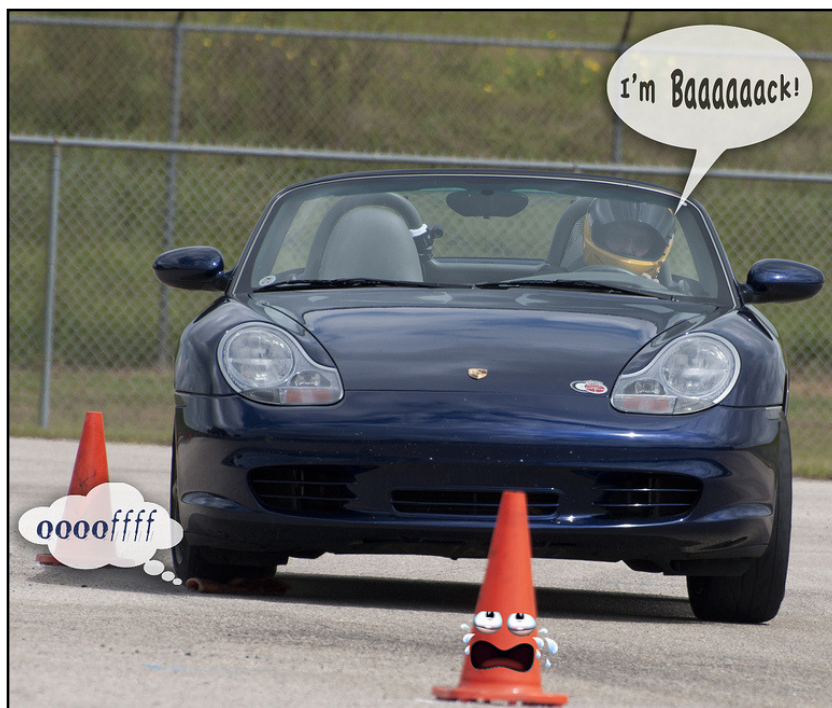
14 Welcome back, Bob Blucher; the cones have really missed you.