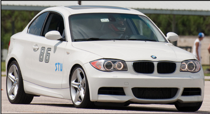
Jeff Binford, BMW 135i