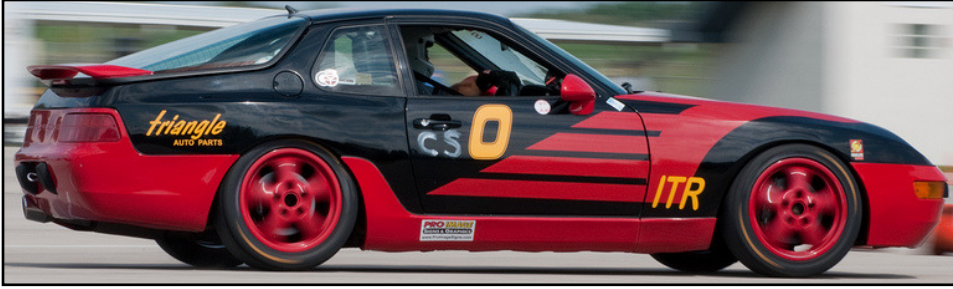
Gary Stratton, Porsche 968