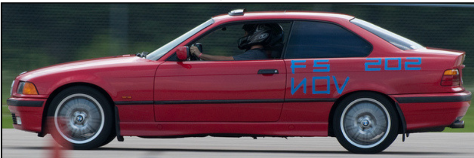
Lachezar Hristov, BMW 323is