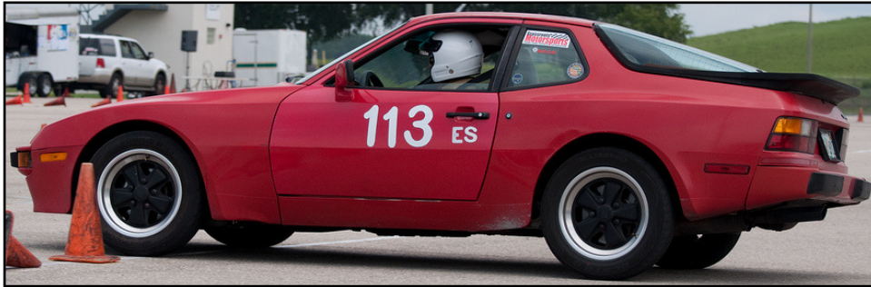
Ben Turner, Porsche 944