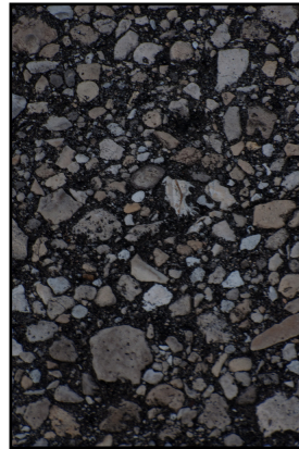
In case you wondered what the racing surface looked like at LCTC.