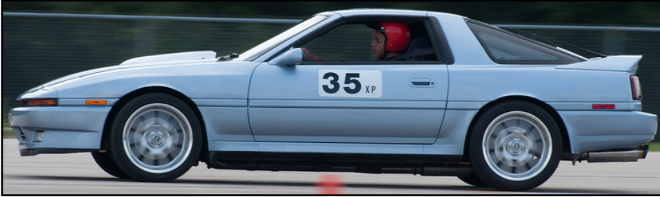
Hayden Gill, Toyota Supra