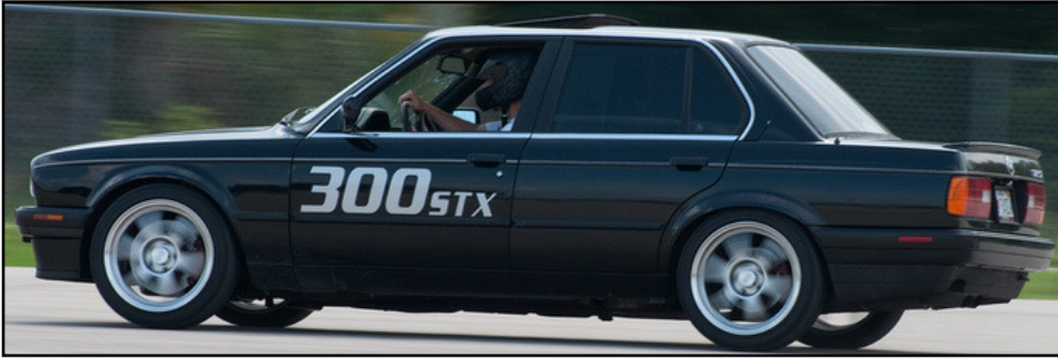
Travis Turner, BMW 325i