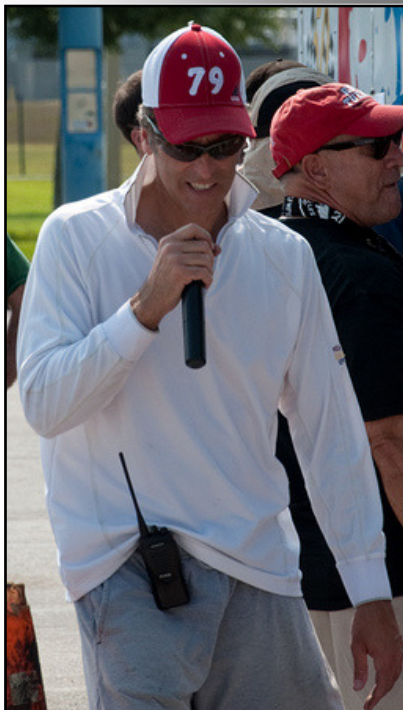
Martin Sports Car Club

Top 20 - Spring Mini-Prix - Sun 06-12-2011