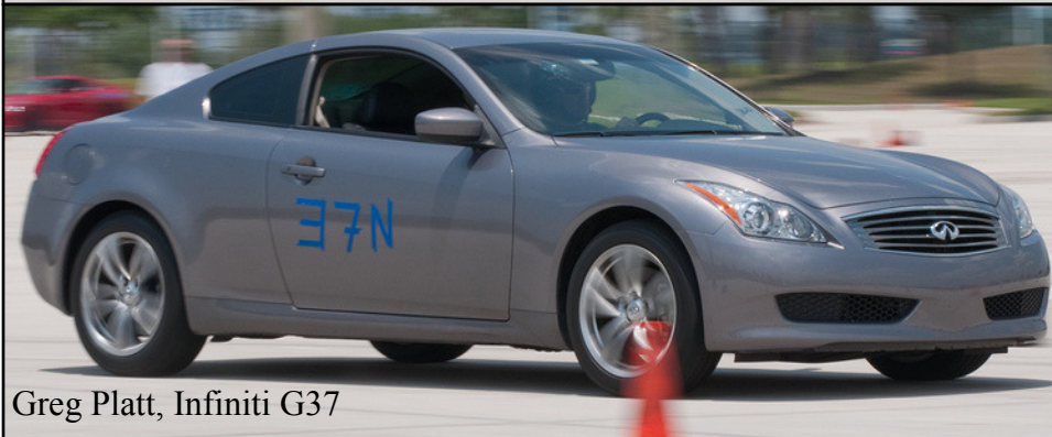
Greg Platt, Infiniti G37