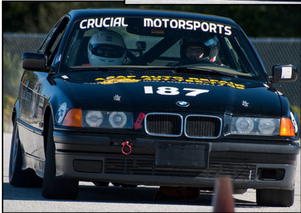
Phil Woodard, BMW 325is