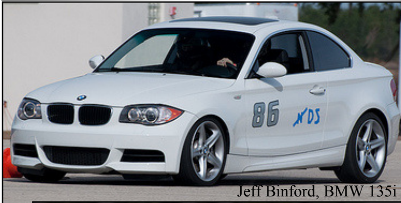
Jeff Binford, BMW 135i