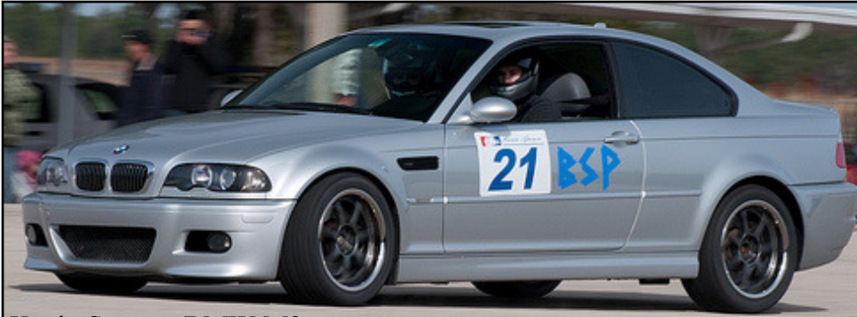
Kevin Spence, BMW M3