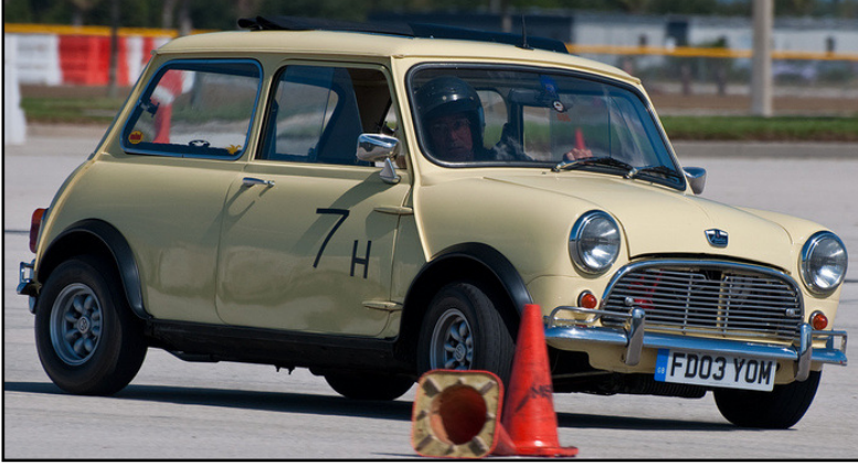
Right: Corky Priep, Austin Mini (Total Coolness)