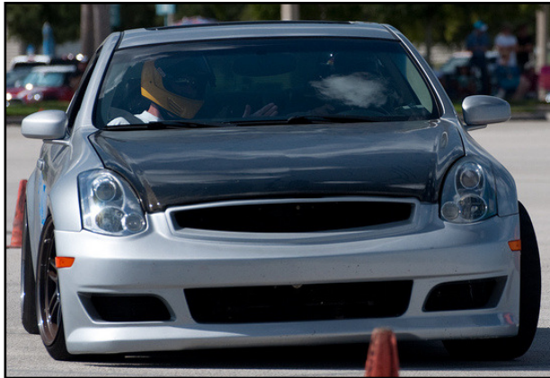
Right: David Ortiz, Infiniti G35