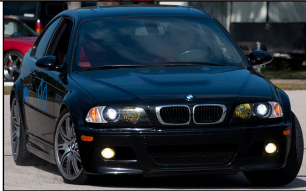
Right: RC Levell, BMW M3