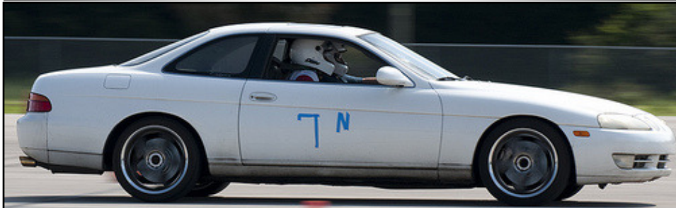
Adriel Gonzalez, Lexus SC300