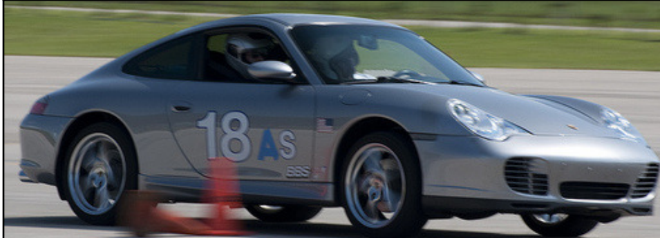
Bill Van Tassel, Porsche 911