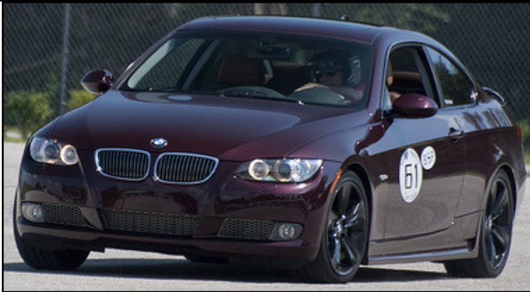
Right: Bill West, BMW 335i