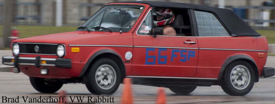
Brad Vanderhoff, VW Rabbit