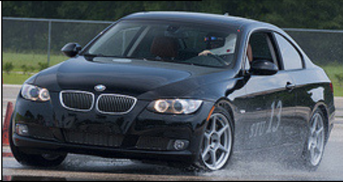
Bert Foschini, BMW 335i