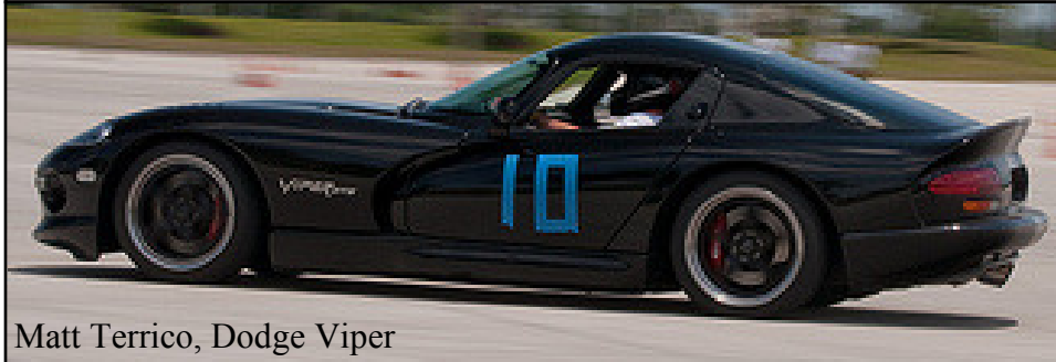
Matt Terrico, Dodge Viper