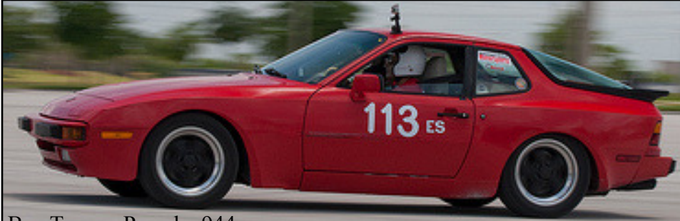
Ben Turner, Porsche 944