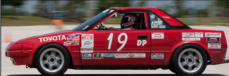
Penny Belvoir, Toyota MR2