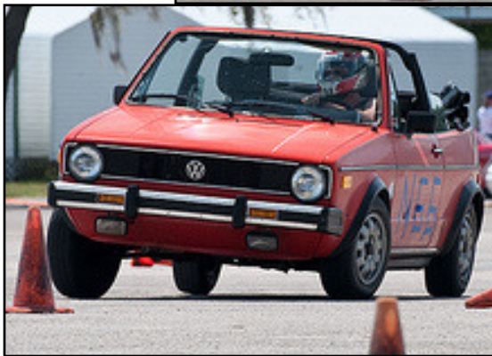
Brad Vanderhoff, VW "Waskily Wabbit" Convertible