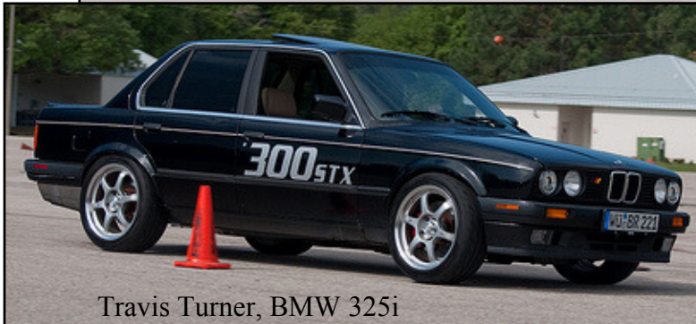
Travis Turner, BMW 325i