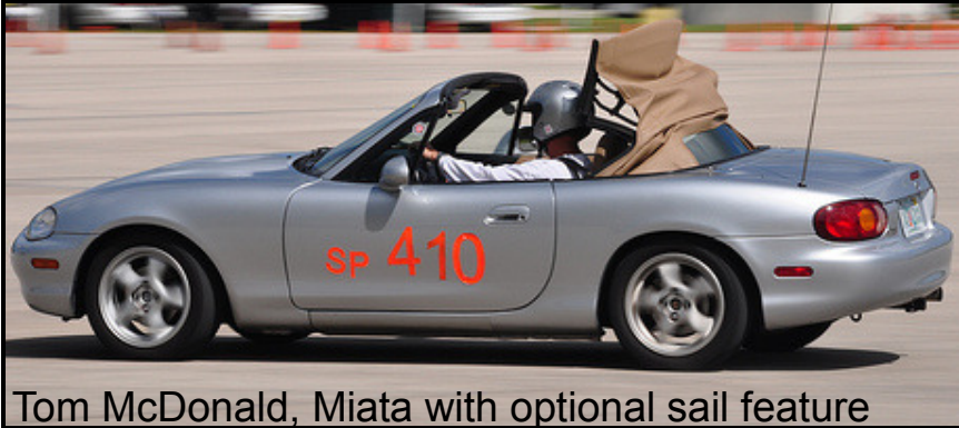
Tom McDonald, Miata with optional sail feature