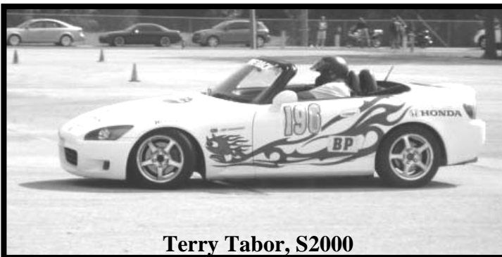
Terry Tabor, S2000